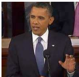
President Obama announced this project in his 2011 State of the Union Address